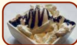
VANILLA BEAN GELATO (w/ chocolate syrup & whipped cream) (1 SCOOP) ..... $5.00

ATTENTION: WE CANNOT GUARANTEE THAT OUR GLUTEN & NUT FREE PRODUCTS ARE 100% ALLERGEN-FREE.