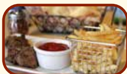
STEAK & FRIES ..... $14.00