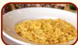
MACARONI & CHEESE Kraft ..... $11.00