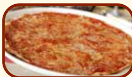
12" ULTRA THIN NEAPOLITAN PIZZETTA ..... $12.50