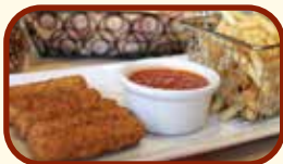
MOZZARELLA STICKS & FRIES (5 PIECES) ..... $11.50