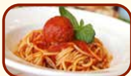
SPAGHETTI WITH (1) MEATBALL ..... $11.50