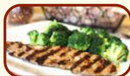
GRILLED CHICKEN WITH BROCCOLI FLORETS ..... $13.00