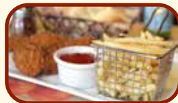
CHICKEN FINGERS & FRIES (4 PIECES) ..... $12.00