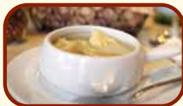
TORTELLINI SOUP (12 oz cup) ..... $8.50