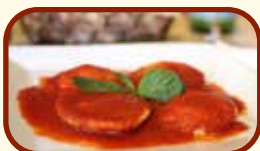
CHEESE RAVIOLI POMODORO ..... $11.00