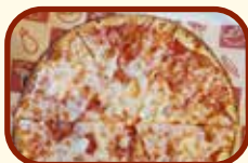
12" CAULIFLOWER NEAPOLITAN PIZZETTA ..... $13.50