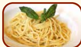
PASTA WITH BUTTER SAUCE (Penne or Spaghetti) ..... $10.00