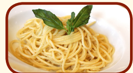
PENNE WITH BUTTER SAUCE ..... $8.50