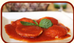
CHEESE RAVIOLI POMODORO ..... $9.25