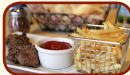
STEAK & FRIES ..... $11.50