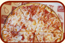
CAULIFLOWER NEAPOLITAN PIZZETTA .... $11.50