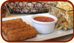
MOZZARELLA STICKS & FRIES (5 PIECES) ..... $9.50