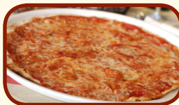
ULTRA THIN NEAPOLITAN PIZZETTA .... $10.50