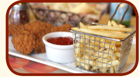
CHICKEN FINGERS & FRIES (4 PIECES) ..... $10.00