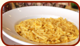
MACARONI & CHEESE Kraft ..... $9.25