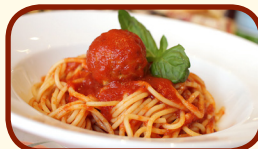
SPAGHETTI WITH (1) MEATBALL ..... $10.00