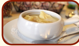
TORTELLINI SOUP (12 oz cup) ..... $7.25