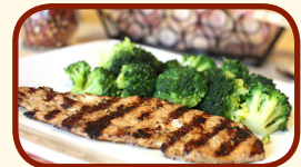
GRILLED CHICKEN WITH BROCCOLI FLORETS ..... $10.50