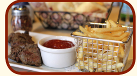
STEAK & FRIES $11.50