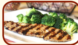
GRILLED CHICKEN & BROCCOLI $10.50