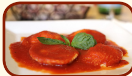
CHEESE RAVIOLI POMODORO $9.50