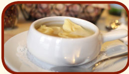
TORTELLINI SOUP (12 oz cup) $6.75