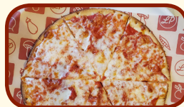
CAULIFLOWER NEAPOLITAN PIZZETTA $11.50